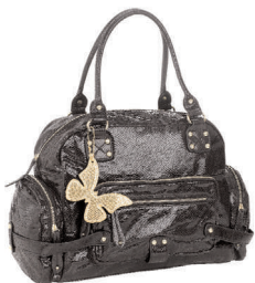
Shiny Snake Tote River Island, £35 www.accessorize.co.uk

SPA OF THE WEEK: BUSHMANS KLOOF WILDERNESS RESERVE & WELLNESS RETREAT, SOUTH AFRICA www.bushmanskloof.co.za