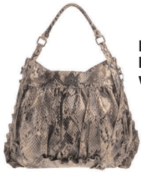
Fiorelli Vanilla Bronze Tote, £59 www.fiorelli.com