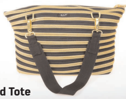
Black and Gold Tote Bam bags, £74.99 www.bambags.co.uk