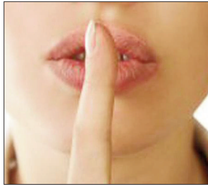
SHHHH ... it's top secret

Two thirds claim the reason they don't confess to getting help from things like false eyelashes and fake tan is because