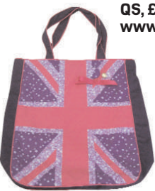
Pink Union Jack Tote QS, £6 www.qsgroup.co.uk