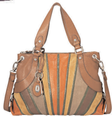
Maddox Patchwork Convertible Tote, £180 www.fossil.co.uk